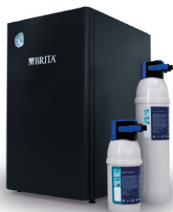
BRITA PROGUARD Coffee