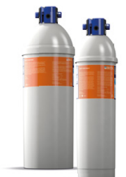
PURITY C Steam