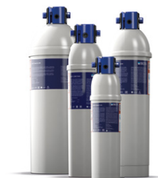
PURITY C Finest