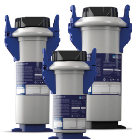
PURITY Quell ST