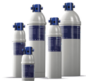
PURITY C Quell ST